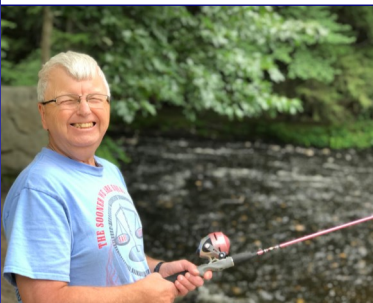
I enjoy Fishing in the Souhegan River