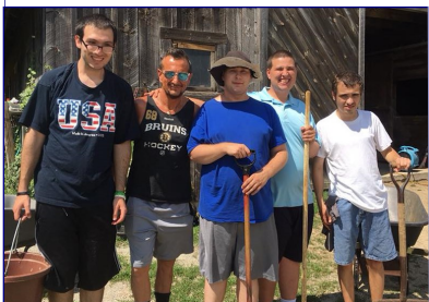
Farm Crew working hard feeding the horses and cleaning the barn.