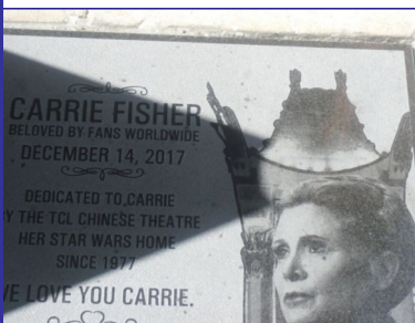
Carrie Fisher's Plaque at the Walk of Fame.