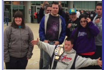
Heading into the WWE Smack Down Event in Manchester.