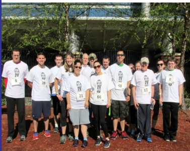
What? Only 5 miles!