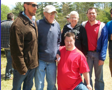
Some of the PalletWorks' crew enjoying the tractor pull event.