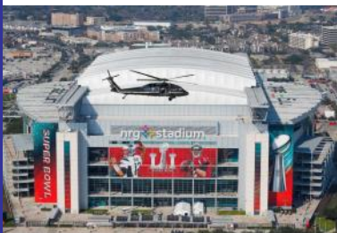
One for the Record Books.